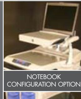
NOTEBOOK CONFIGURATION OPTION