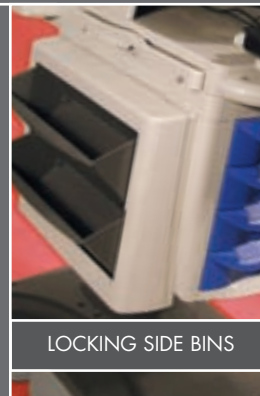
LOCKING SIDE BINS