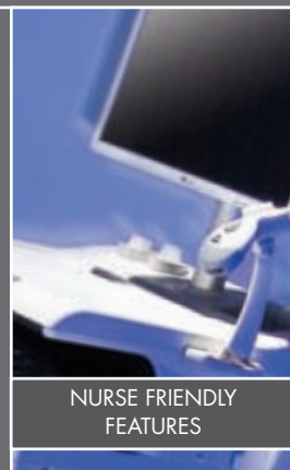
NURSE FRIENDLY FEATURES