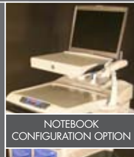
NOTEBOOK CONFIGURATION OPTION